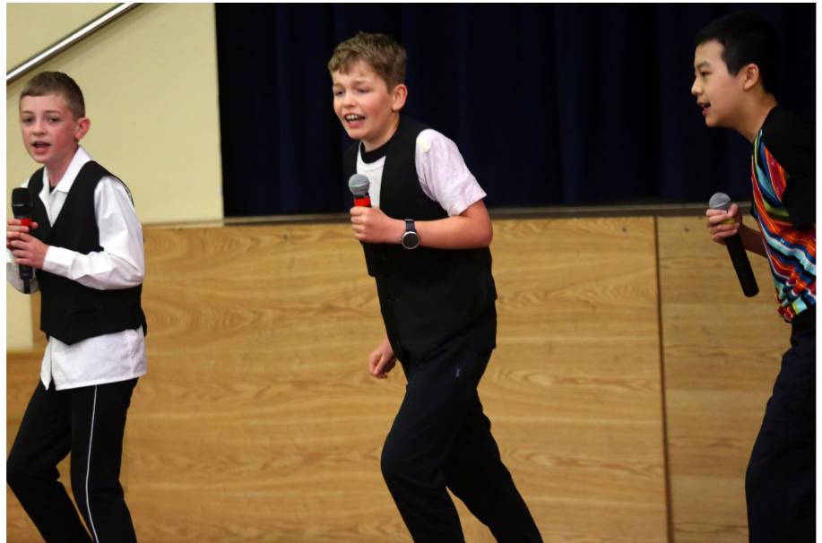
Glee Club performance in the hall.

Currently, parents and carers are not permitted on school grounds. If you are dropping off or picking up your child during school hours, please wait outside the gate and press the buzzer, or contact 9953 1798 to speak to one of our office staff.