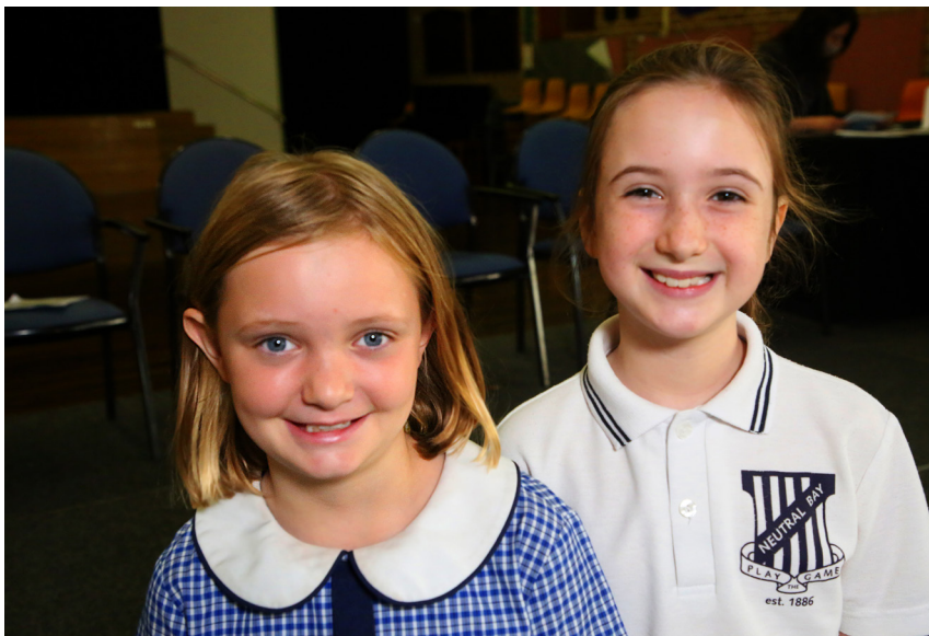
Two of our incredible MCs from yesterday's awards presentation.