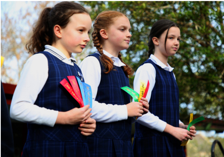
Congratulation to all our students who received an award at our Sports Awards Assembly last term. Full gallery on page 12.