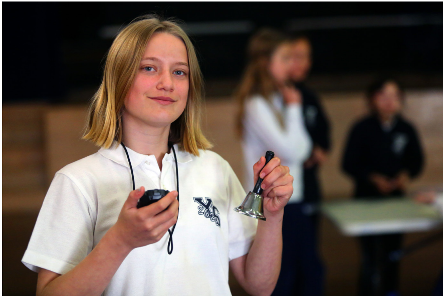
Our year 6 timekeeper from the Premier's Debating Challenge.