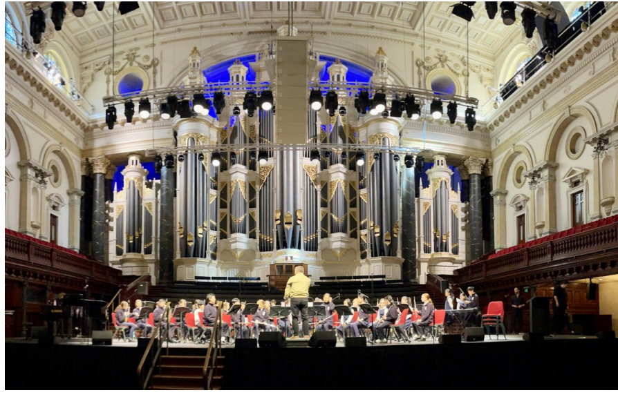
The Senior Concert Band performing at Sydney Town Hall.